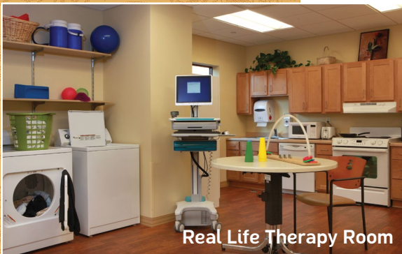
Real Life Therapy Room