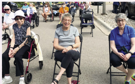
The Minnesota Sinfonia treated residents to a live outdoor performance, providing beautiful music and commentary. The audience was most appreciative.