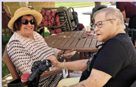
A shaded patio is the perfect setting to catch up with friends and enjoy summer.