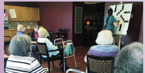
Completing the over-sized crossword puzzle helps residents reinforce brain power while working together toward a common goal.