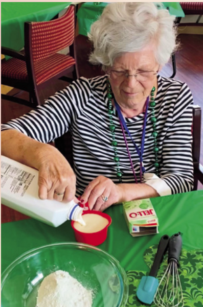
Cooking programs continue to be popular – both the preparation and sharing the delicious treats.