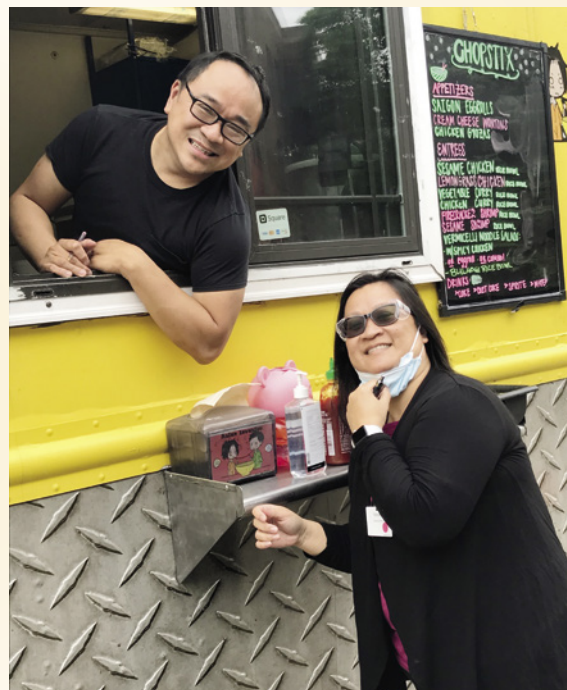
A food truck provided delicious meals with several choices.