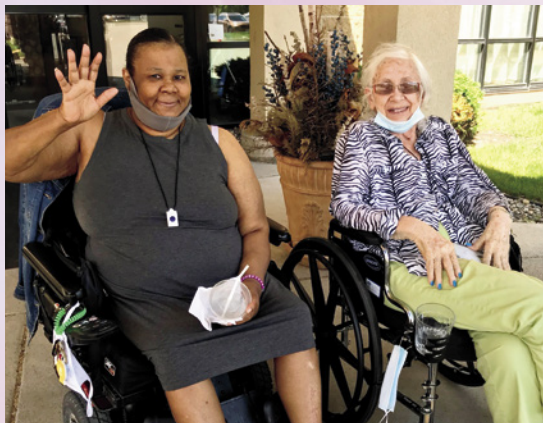
Smiles abound listening to and singing along with a favorite entertainer.