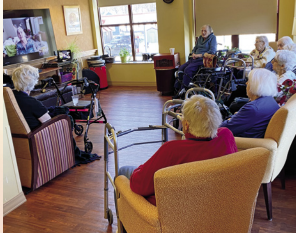
Using Zoom technology, services of all faiths are easily accessible for all residents.