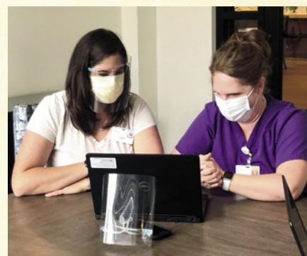
Staff meeting in the new conference room, conveniently located off the main lobby.

modernized to provide efficient, warm, and comfortable surroundings. The renovations will maximize state-of-the-art rehabilitation modules and other resident-centered program facilities. More details will follow.