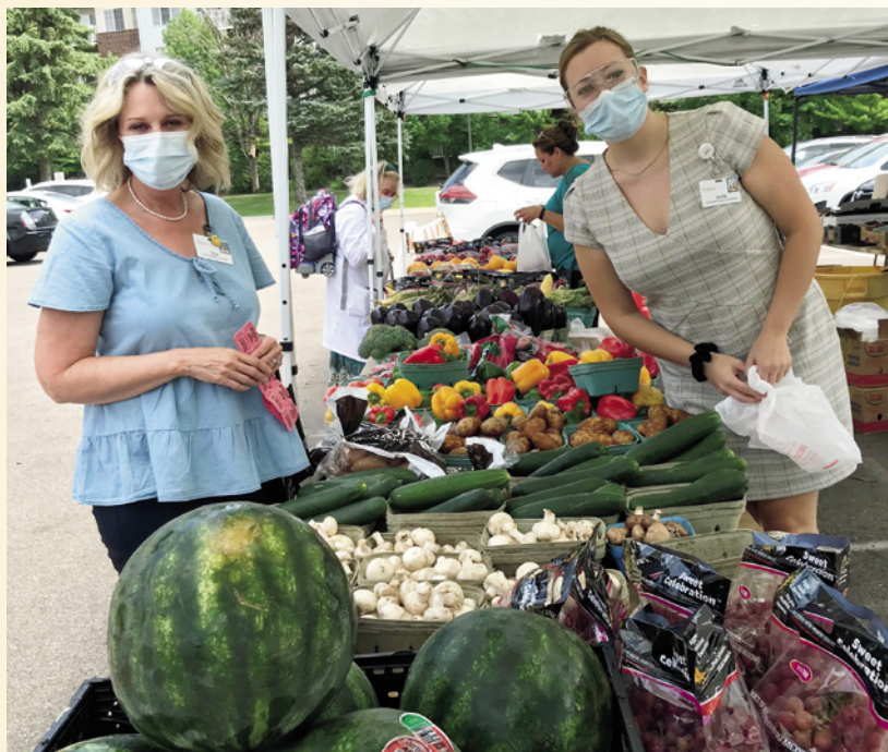
Because the first farmers' market was so successful, staff was treated to a second round of farm stand fresh seasonal produce. The sweet corn and first fruits of the season were sensational!

Every year appreciation is shown to Sholom's employees for their hard work and dedication to the residents. With gratitude to a very generous donor, staff appreciation events this summer focused on "good eats."