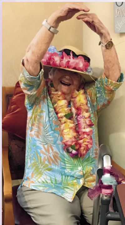
Residents dressed the part for their arm-chair tour of Hawaii, which even included hula lessons.