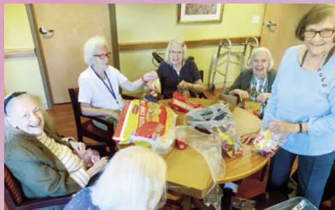
Residents enjoy a laugh while making gifts of appreciation for the home health aides.