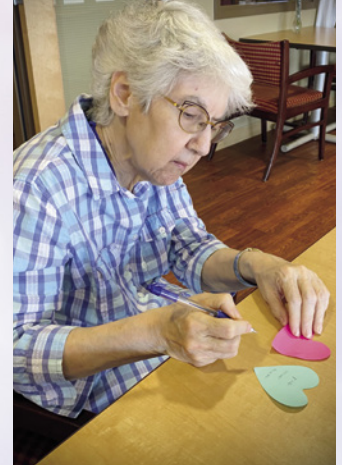
Arts programs are designed to offer dexterity and creativity.