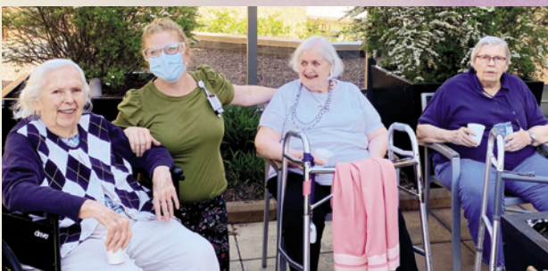
Residents gather for a conversation with staff on one of the beautiful patios at the Shaller Family Campus.