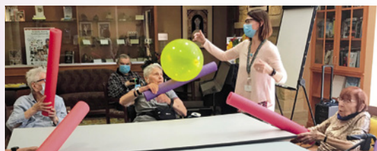
Residents love the energy and exercise when playing Sholom's Table-Top Ping Pong.