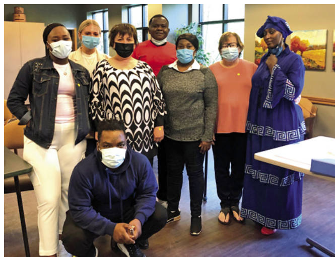
Trained Medication Assistants celebrate receiving their TMA certification.

This program invests in Sholom's top performers who pursue educational opportunities outside Sholom's walls which relate directly to their career development at Sholom. Funds are available on a first-come, first-served basis, with $1,000 – $4,500 available per person depending upon the focus and certification/degree of the coursework. Following successful completion of the respective programs,