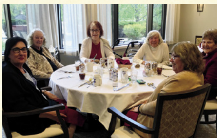
Residents agree that the new surroundings and ambiance completely refresh the dining experience.

Since the first fledgling conversations revealed plans for upgrades and changes to both Sholom campuses, the excitement has grown exponentially. The kitchen air conditioning at the Shaller Family Sholom East Campus, expansion of WiFi and infrastructure upgrades at both campuses, a new parking lot at the Ackerberg Family Sholom West Campus, and installing additional laundry facilities at Knollwood Place Apartments represent just a few of the Capital Campaign improvements completed which better the lives of Sholom residents.