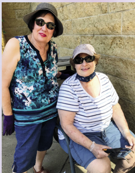
Planting flowers on the patio of Knollwood Place Apartments made good use of many green thumbs.