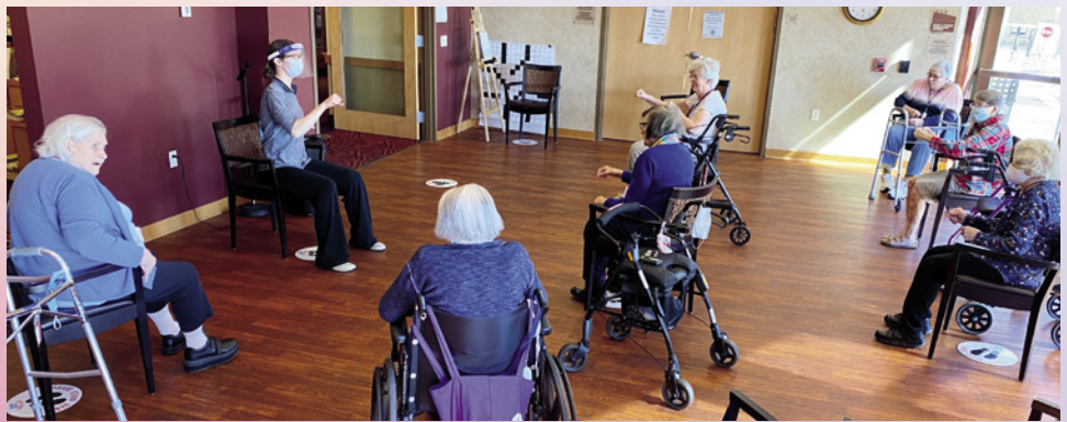
Therapeutic Recreation staff provide exercise classes for all abilities.