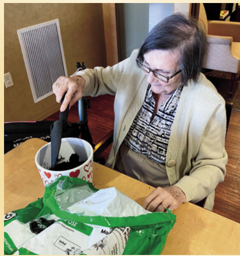
Residents enjoyed a Spring project creating beautiful planters.