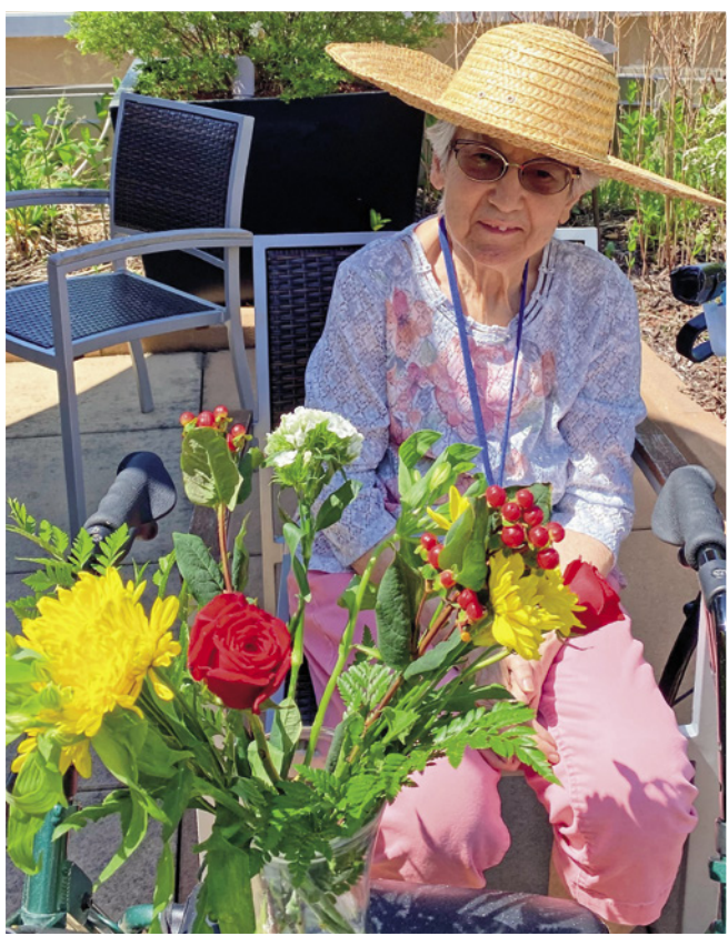
Flower arranging is very popular. Much gratitude is sent to Trader Joe's which donates flower to both campuses each week.