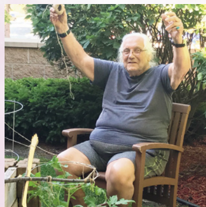
This gardener, sitting beside the myriad of tomato plants he grew from seeds, is quite animated as he describes how big the vines will grow.