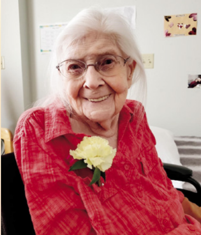
Celebrating Mother's Day with a beautiful corsage from the Sholom Auxiliary.