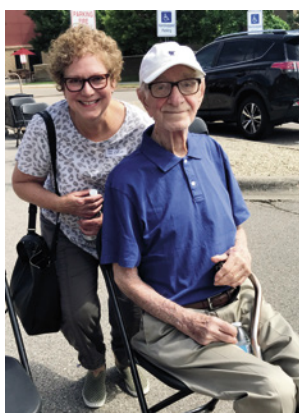
Eagerly awaiting the Sinfonia concert on a lovely summer day.