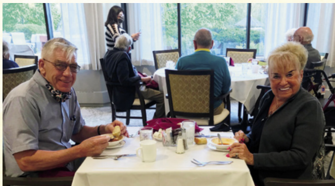
Residents are enjoying the soft-opening in the newly refurbished dining room. Continental breakfast is available Monday-Friday in the KPA Dining Room.

T remendous thanks go to every contributor to Sholom's Care Comes First Capital Campaign. Your generosity is making a dream come true!