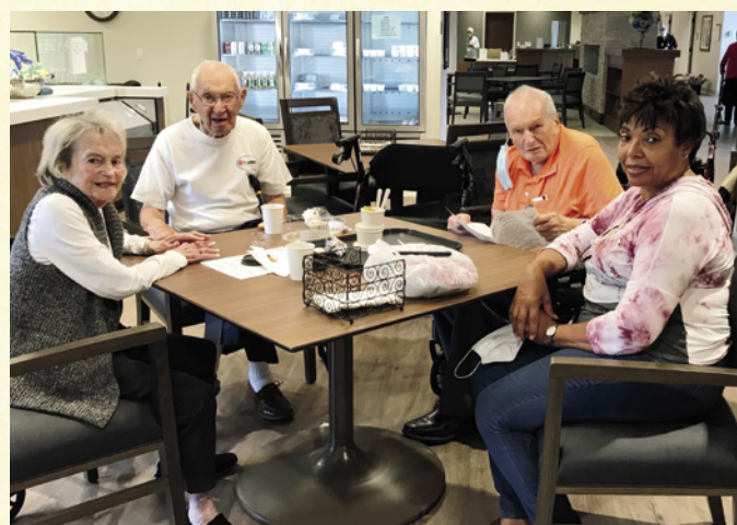
The brand new Nosh Nook is available for lunch, snacks, or coffee and “schmoozing.”

Sholom is eager to share these wonderful changes with the community. The long awaited re-dedication and open house at the Knollwood Place Apartments will take place on Sunday, September 19, 2021, 1:30 – 3:00 pm , preceded by the Sholom Alliance Annual Meeting. We hope you will join us to experience the magnificent renovations at Knollwood. Please mark your calendars now; more information will be published later in the summer. We look forward to toasting this success with you.