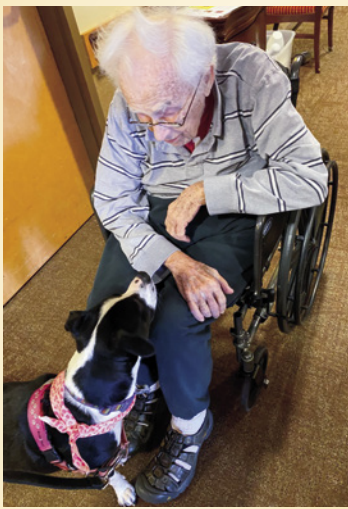
Sholom residents look forward to visits from their furry friends. With this special friend, Roxi, the feeling is mutual.