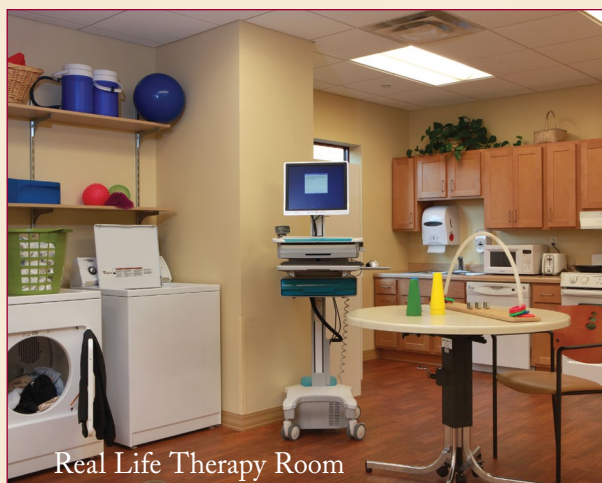
Real Life Therapy Room