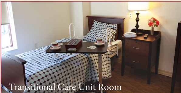
Transitional Care Unit Room