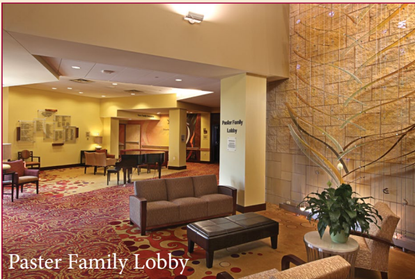
Paster Family Lobby

Shirley Chapman Sholom Home East features a unique “neighborhood” approach to nursing focused on personal care by a dedicated care team in a home-like setting. There are eight “households” or clusters of private* rooms in the Chapman, four on each of two floors. Like any home, every household has a warm, family kitchen and dining room/lounge which serves as the central gathering spot for its residents and visits by family and friends.